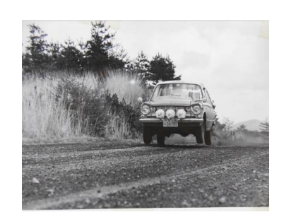
Mitsubishi Colt 1000F undergoing high-speed testing in