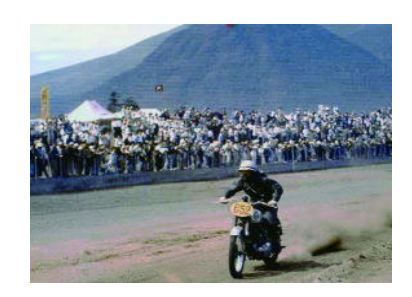
1957 2nd Asama Volcano Race.

Based on this history, the Tsumagoi Village Motorsports Promotion Organisation was established in 2009, headed by the mayor of Tsumagoi Village, with the participation of various departments of the municipal office, tourism-related organisations and organisations involved in motor sports in the village. Through various projects, the organisation aims to develop sound motor sports, improve safe driving techniques and morals, and tackle environmental issues, while pursuing new forms of motor sports in Tsumagoi Village, the birthplace of motor sports, and contributing to regional revitalisation and the promotion of traffic safety.