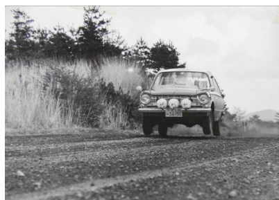
Mitsubishi Colt 1000F high-speed driving test in