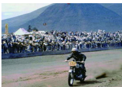
2nd Asama Volcano Race in 1957

Based on these histories, the Tsumagoi Village Motorsports Promotion Organisation was established in 2009, with the mayor of Tsumagoi Village as its rep and with the participation of various departments of the village office, tourism-related groups and organisations involved in motor sports in the village. The aims of organisation are; to develop sound motor sports, to enhance safe driving techniques and morals, to tackle environmental issues through various project, and to pursue a new way of motor sports from its birthplace in Japan while contributing to regional revitalisation and improved traffic safety.