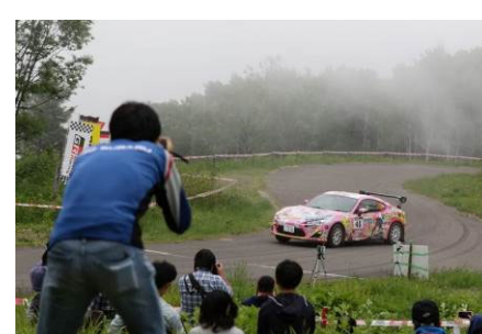
SS in 2018 rally event