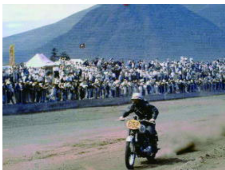
2nd year of Asama Volcano race in 1957

And for motorsports, Tsumagoi is known as a birthplace of the Japanese motorsports culture. The Asama volcano road race for motorcycle started in 1955 and the one of the oldest race track was opened in 1957 for research and development of the Japanese motorcycle and car manufactures. After motorcycle races, the track became a common venue for rally cars. Datsun's Safari preparation continued till the mid '70s and Mitsubishi develop the cars at same time for the Southern Cross Rally. A part of the track still remains as a village heritage. In 2009, Tsumagoi motorsports promotion organization was founded by Tsumagoi mayor, Tsumagoi Commerce and Industry Association and Toursim office around the village.