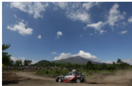
Asama race track in 2014