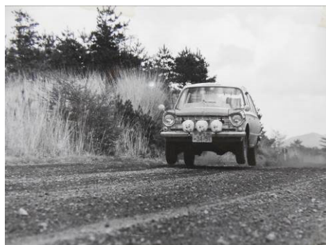
Colt 1000F during Mitsubishi rally car development test in 1968