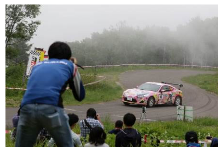
Spectators area in 2018